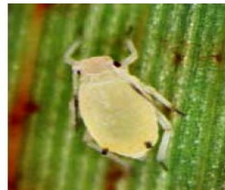
Figure 3: Sugarcane aphid (New invasive)