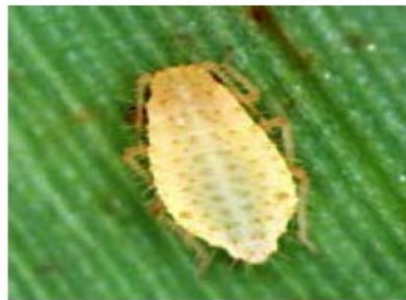
Figure 2: Yellow Sugarcane aphid

Or come by Extension Office at the Carson County Courthouse for more information.