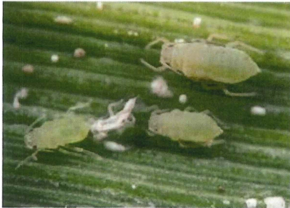
Russian wheat aphids.

into the leaf tissue while feeding. In addition to feeding damage, the aphids are vectors of barley yellow dwarf virus (BYDV) and Cereal yellow dwarf virus (CYDV), which cause barley yellow dwarf (BYD). By controlling the volunteer wheat and delaying the planting until after October 1, there is less time for the aphid populations to become established.