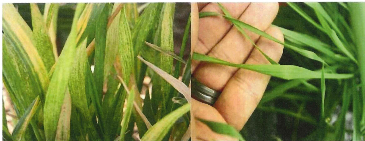
Yellow and mottled leaves from wheat streak mosaic virus.

http://varietytesting.tamu.edu/wheat/docs/e337wheatstreakmosiacvirus-2.pdf BYDV infected plants are yellow and stunted, and plants often have underdeveloped root systems.