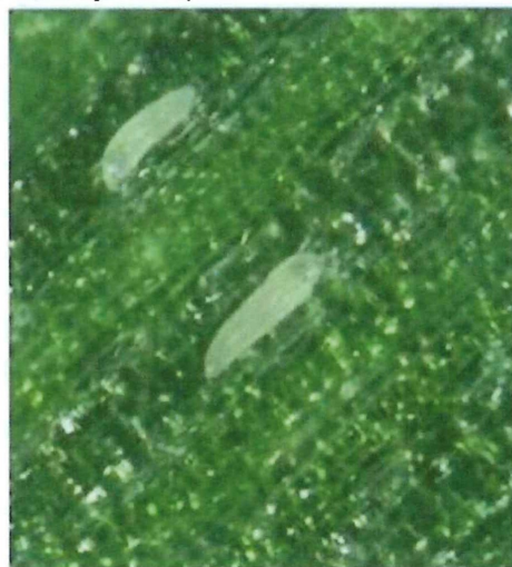
Wheat curl mite

Wheat can be infected with a single virus or a combination of the three viruses. Yield reductions are dependent on the severity of the disease infection, but the greatest yield losses generally occur in early planted wheat fields. Wheat that is planted early (August and September) for fall grazing is especially susceptible to viral diseases as there has not been adequate time to break the “green bridge” between volunteer wheat that serves as a host for the wheat curl mite/viral diseases and the newly established wheat field.