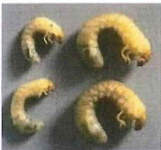
White grubs and larva