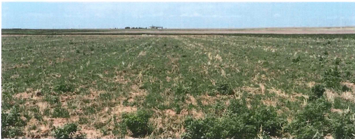
Volunteer wheat and summer weeds during the summer fallow.

There are many risks associated with volunteer wheat. Volunteer wheat can harbor insects and disease pathogens that can be devastating to your upcoming wheat crop in addition to the crop of your neighbor. While it is often believed that volunteer wheat can be a good source of fall pasture, the negative ramifications associated with volunteer wheat far outweigh any potential benefits. In order to minimize potentially significant yield reductions, it is recommended that the volunteer wheat crop be terminated at least two weeks prior to establishment of the next wheat crop in order to break the “green bridge”. Once the “green bridge” is broken, populations of insects and disease pathogens may not develop in the new wheat crop.