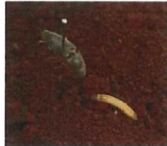
True Wireworm Beetle