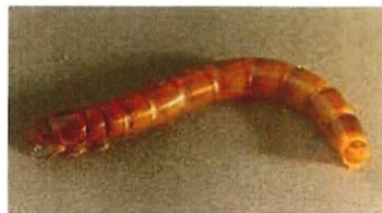
False Wireworm Larva