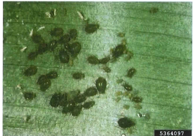
Bird cherry-oat aphids, Photo Frank Peairs, Bugwood.com